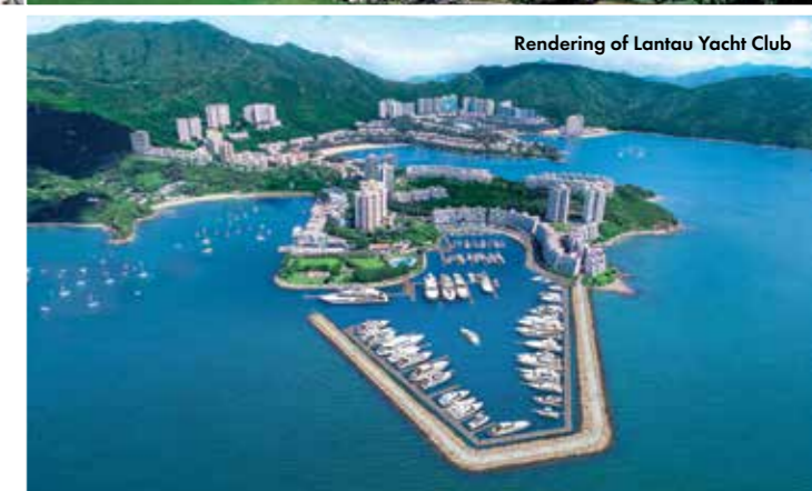
Rendering of Lantau Yacht Club

Recently, golf course renovation works were introduced to increase the playability and enhance the golf course aesthetics. Works on the Ruby and Diamond course were completed in 2018 and 2019 respectively while the renovation work on the Jade course will kick off in late 2020. Besides the golf courses, members and guests may also enjoy