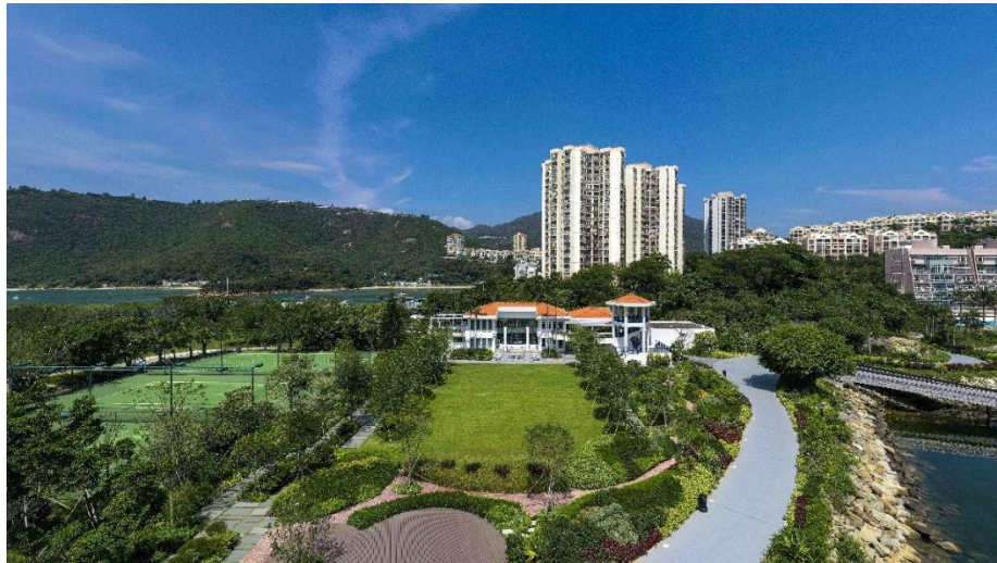
The LYC Clubhouse and the seaside lawn