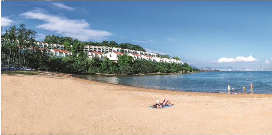
Left: Tai Pak Beach Lower Left: D'Deck Lower Right: Spa Botanica at Auberge Discovery Bay